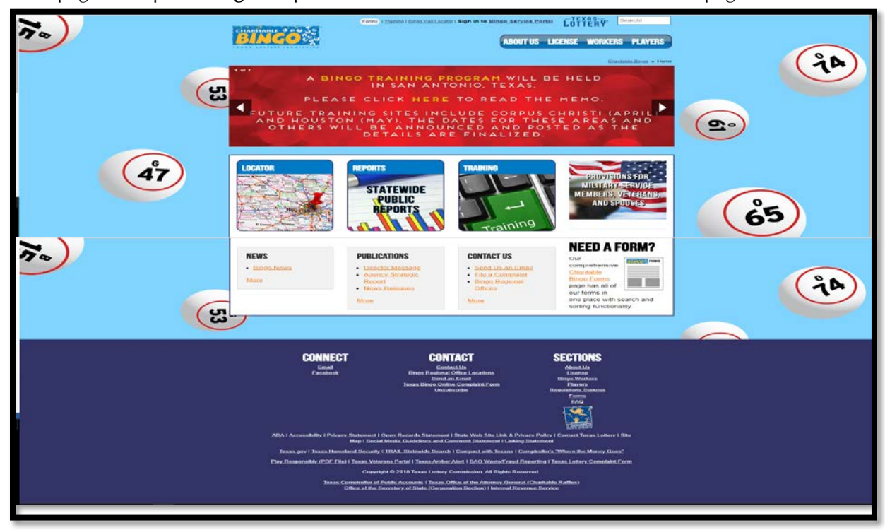
Figure 5 CBOD's Website Homepage

The CBOD website contains a lot of information to assist stakeholders. However, the home page is not organized according to the different audiences needs and in a manner that is easy to locate information. The current home page layout requires a visitor to have a general understanding of bingo terms in order to be able to determine which button to click on or option to select. For example, a non-profit organization that has never conducted bingo or held a license would not know where to find the information they need to get started based on the current home page descriptions. Figure 5 provides a screen shot of CBOD's website home page.